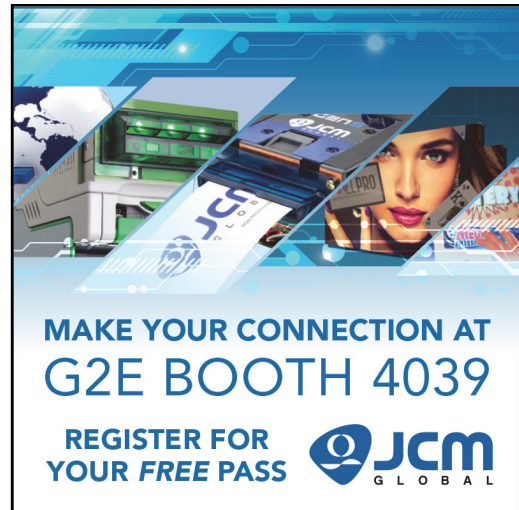
Click above to connect with JCM at G2E 2017 Booth 4039

For additional information on JCM Products, visit the JCM Global website at www.jcmglobal.com , or contact your local JCM Sales Representative at (800) 683-7248.