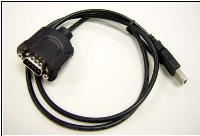
Figure 1: SIIG USB-to-Serial Adapter