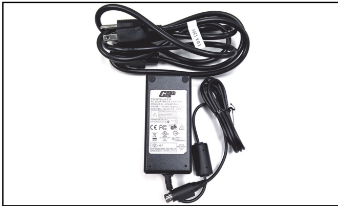
Fig. 1 GEN Printer 24Vdc Power Supply Kit (P/N 350-00258-100)