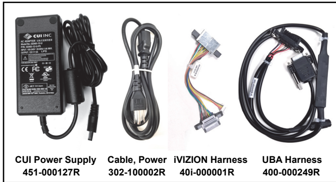
Figure 1 Power Supply Kit for iVIZION® and UBA®