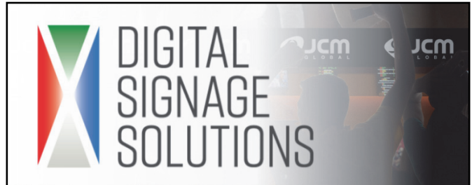
JCM's Digital Signage Solutions (DSS) Create a Unique Digital Display Experience for Your Customers

For more information on JCM's full line of Digital Signage Solutions (DSS), including the MAX-S, FLEX, CUBE and ELEMENTS displays and other JCM Products, visit the JCM Global website at www.jcmglobal.com , or contact your local JCM Sales Representative at (800) 683-7248.