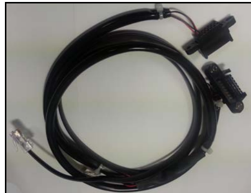
Figure 3: JCM BlueWave Adapter Cable (P/N 400-000086R)

For additional information, contact your local JCM Sales Representative at (800) 683-7248.