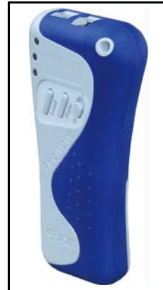
Figure 2: JCM BlueWave™ 2.0 Download Tool (P/N 550-100720R)