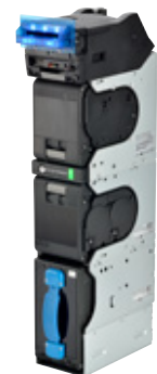
UBA Pro-RQ SS800 Cash Box