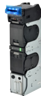
UBA Pro-RQ SH400 Cash Box