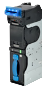
UBA Pro-RT SS800 Cash Box