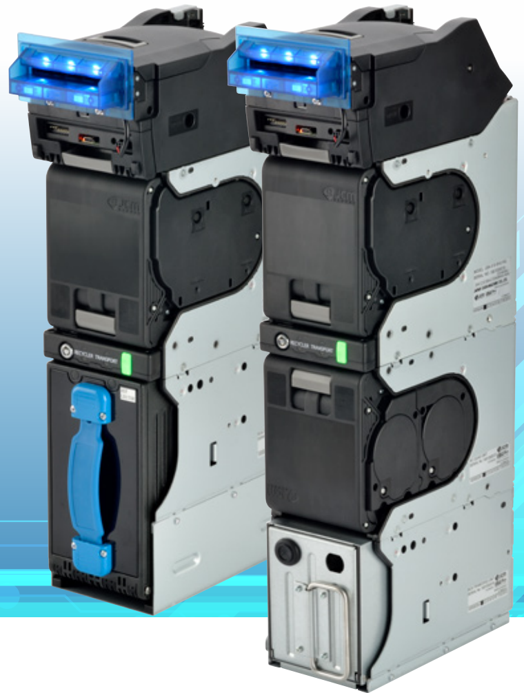
UBA Pro-RT SS800 Cash Box