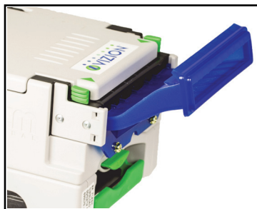
Figure 1 iVIZION Validator with Bally Bezel

The affected Bezel is identified by Bally Part Number 214710-00001, GUIDE,BA,JCM 86MM, CLOACA, BLUE, AP-1.