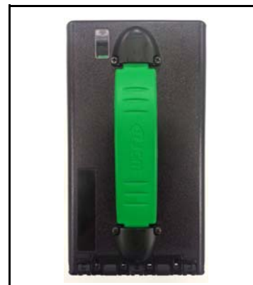
Figure 2: iVIZION Cash Box Handle and Handle Covers