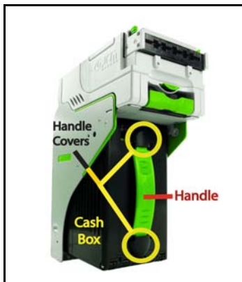
Figure 1: iVIZION Unit and Cash Box

The Handle (EDP#147946) material has been strengthened, and the Handle Covers (EDP#147947) include several design enhancements for improved durability. Updated features include a longer Boss Length (Figure 3), Stiffening Ribs and larger Mounting Screws securing the Handle Cover to the iVIZION Cash Box (Figure 4).